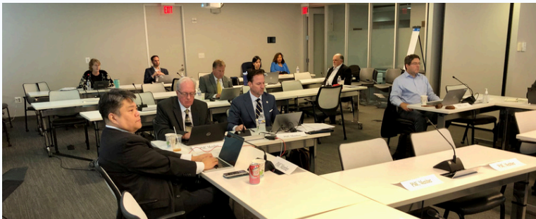
September 2024 Program Management Committee Meeting

Thank you to our members for your ongoing contributions to the vital work of standards development. We are pleased to share highlights from our third quarter activities.